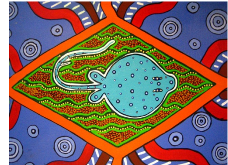
Artwork & Artist by the Quandamooka Saltwater Murris (Stradbroke Island)