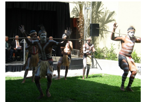
Nunukul Yaggera Aboriginal Dance Troupe SIAP Opening Ceremony